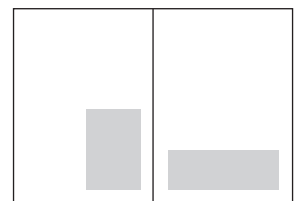
Quarter Page Banner