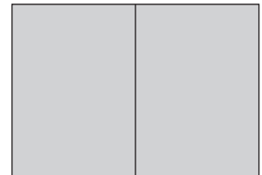
Double Page Spread

*Add an extra 3mm bleed on all sides of supplied artwork on both Double and Full pages.